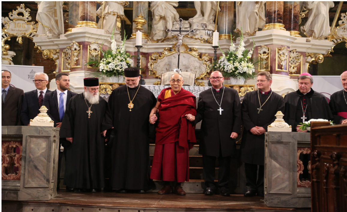
On September 22, 2016 in Świdnica (30km from Wrocław) His Holiness the 14th Dalai Lama – who came to Wrocław on invitation of mayor Rafał Dutkiewicz - together with catholic, ortodox and evangelic priests, Imam of Wrocław and Rabin of the White Stork Synagogue just after signing appeal to the world for Freedom and Peace.